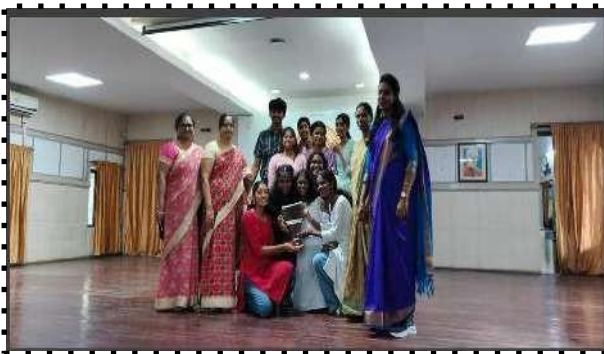
Group Dance 3 rd prize winners