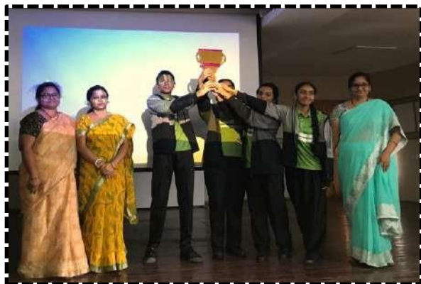
Spell Bee 1 st prize winners