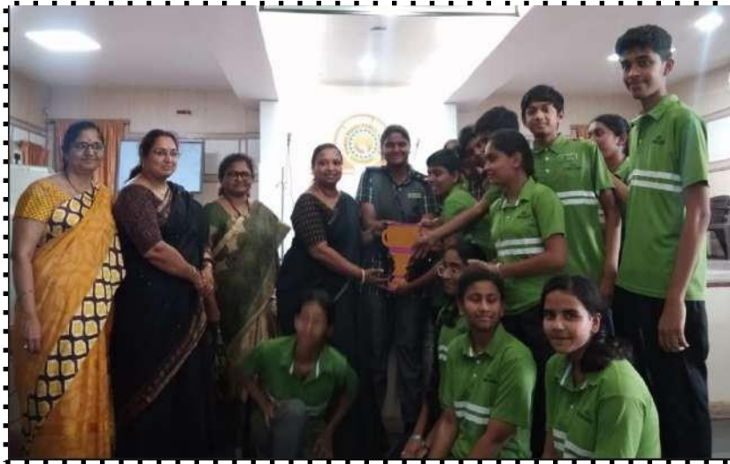
Group Singing 1 st prize winners