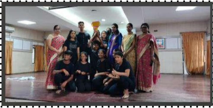
Group Dance 1 st prize winners

Minimum 8 to 10 students participated in each house. All our young maestros who participated in the competition contributed to make it a huge success.