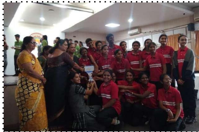
Group Singing Bee 2 nd prize winners