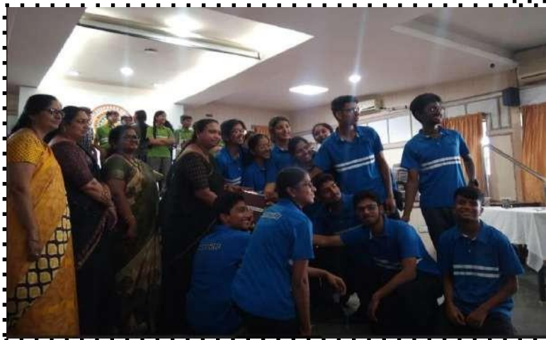
Group Singing 3 rd prize winners