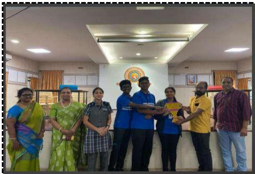
Debate 1 st prize winners